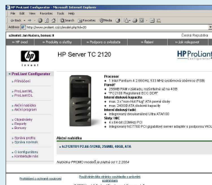
Web interface in the HP standard

The multilanguage system contains a total of 5 modules and its server part uses the Linux platform. The system works in the Intranet and Internet environments and it has been put on the market in the Czech Republic and in Slovenia. Its expanding to other countries is being prepared.